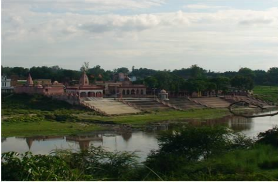
Bela Bhawani Temple

Bela Pratapgarh, popularly known as Pratapgarh is the headquarters town of the district. It lies on Allahabad-Faizabad main road at a distance of 40 kms from Allahabad. It is well connected with Faizabad, Jaunpur, Rae Bareli and Sultanpur. The town Bela Pratapgarh gets its name from Bela Bhawani Temple situated on the banks of the river Sai which flows to the north & east of the town. It is believed that Shri Rama once crossed the river before dawn and offered his prayers to Goddess on its bank. Later, as the legend goes, a temple known as Bela was founded at this spot. Baba Bhikhari Das, the great Hindi poet of the 18 th century was born here and composed his famous "Kavya-nirnaya" here in 1802. The particular area was annexed as cantonment for the Oudh auxiliary force and was made headquarter of the district, after first freedom struggle was suppressed by the British. Around the temple, one Dharmshala, sub-post office and a few small pottery units are located. Local people offer prayers to the district on Tuesday & Saturday. During the months of October and April/May Navratri Pujas are organized with enthusiasm.